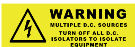
Example of sign required where multiple isolator / switch-disconnector devices are used (clause 5.5.2)