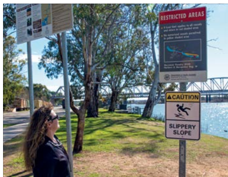
Boating on the River Murray demands special care

The rules that apply to boating on the River Murray are essentially the same as those for other navigable waters. However, additional rules under the River Murray Traffic Regulations that specifically apply to bridges, ferries and locks on the River Murray are incorporated into the Harbors & Navigation Regulations 2009 and are outlined below.