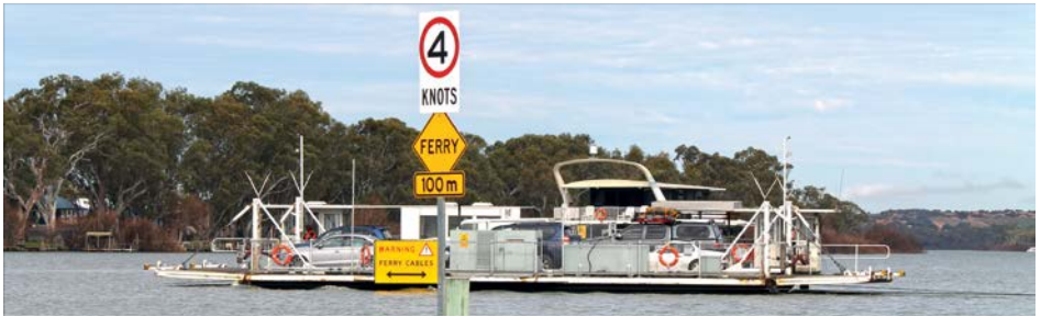
A four knot ferry crossing.