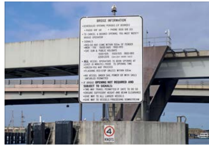
A four knot speed limit applies within 100 m either side of all Port River Bridges.

10:00 am to 10:15 am, 3:00pm to 3:15 pm and 6:00 pm to 6:15 pm (extra opening available from 10:00 am to 10:15 pm during daylight saving).