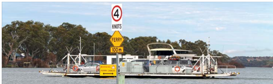
A four knot ferry crossing.