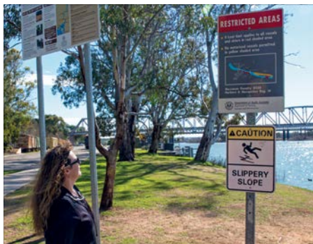
Boating on the River Murray demands special care

The rules that apply to boating on the River Murray are essentially the same as those for other navigable waters. However, additional rules under the River Murray Traffic Regulations that specifically apply to bridges, ferries and locks on the River Murray are incorporated into the Harbors & Navigation Regulations 2009 and are outlined below.